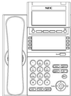
DESI Less 8 Button